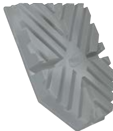
HOT WATER SYSTEM BASES Stylish, stable, easy to install and made to last