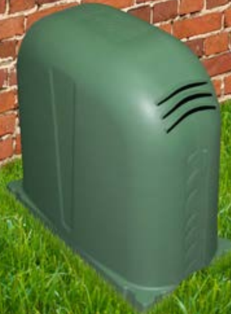
PUMP COVERS Elevating and protecting pumps from harsh weather conditions