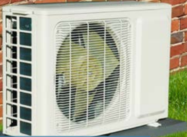
AIR CONDITIONER & EQUIPMENT BASES A stronger lightweight base

BUILT TO OUTLAST THE EQUIPMENT THEY SUPPORT.